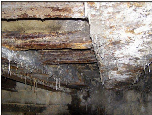
Leachate & oxidation to steel

Whilst we understand the increasing and variable demands made by building societies in report interpretation, our structural engineering reports are related entirely to the property, not the vagaries of the housing market, and are never compromised by the buyer or seller situation.